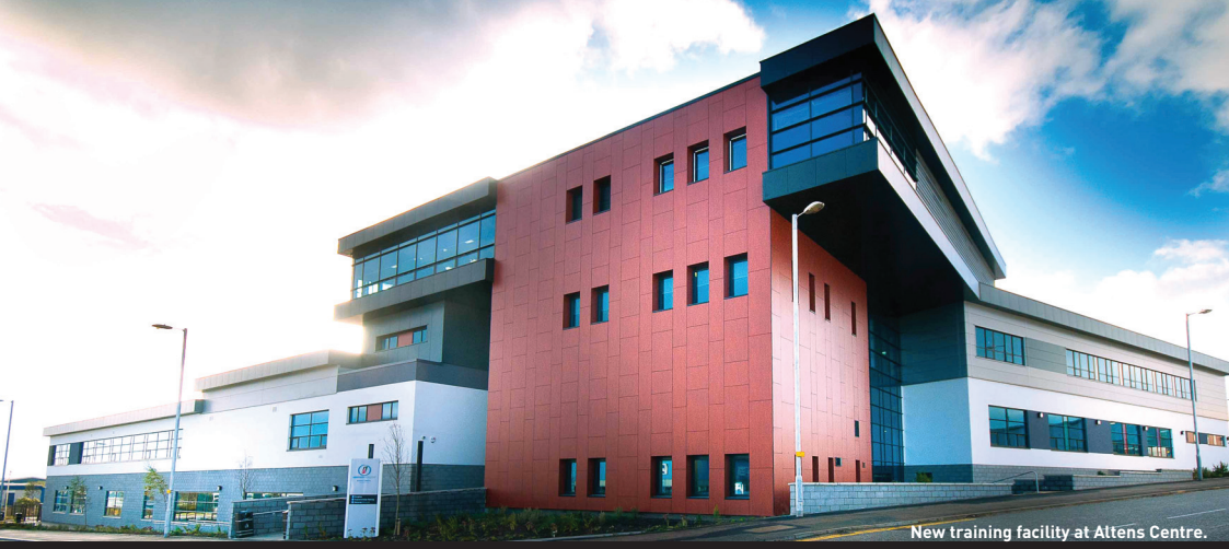
New training facility at Attens Centre.